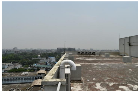
Photograph of building roof-top from East, West, North & South directions