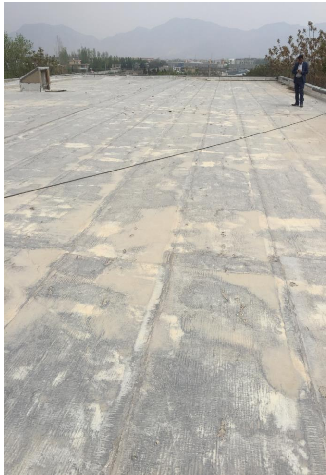
Photograph of Roof-top

Note: A short video of building roof-top can be provided to interested bidders on request.